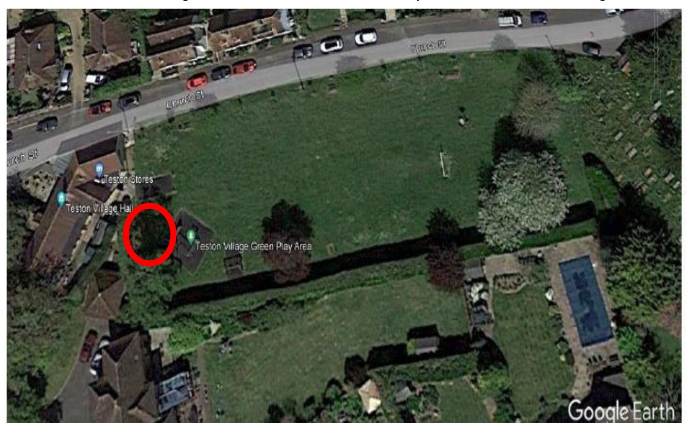
As viewed southwards from Church Street. The Silver Birch is at the centre-rear of the picture.

The Silver Birch is the red ring. Please note the closeness of the Play Area and other trees on Village Green.